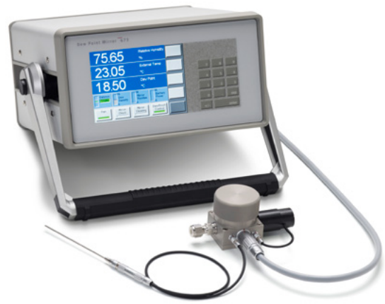
Reference thermo hygrometer

in a database. You can generate certificates for all thermo hygrometers by one click. The certificate is generated from a template. You can freely edit the template to fit your needs. The database of calibrations holds the history of calibrations from whole calibration laboratory at one place. You can browse it by quantity, year, sensor type, serial number etc. Looking for calibration history of a certain instrument is a brief. The built-in database browser allows on-line tabular and graphical view of multiple certificates. The software supports export to .csv, .odt, .xml and .pdf formats. Whole database can be backed-up or restored by simple click of a button. There is also provision of automatic periodic back-up.